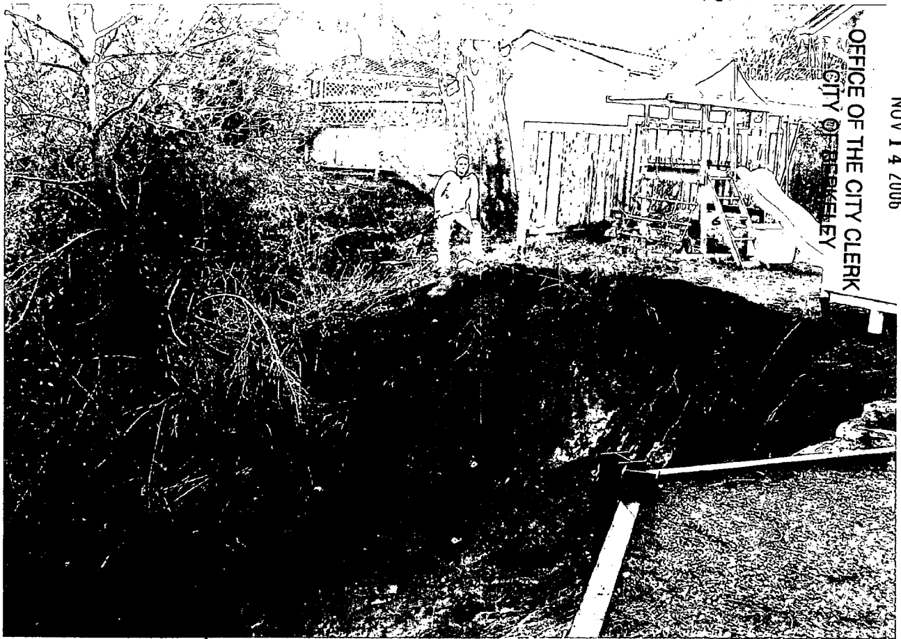
NEW YEAR'S EVE STORM - PHOTO JANUARY 3 2006 PINOLE, CA URBAN CREEKS COUNCIL

OFFICE OF THE CITY CLERK CITY OF BERKELEY