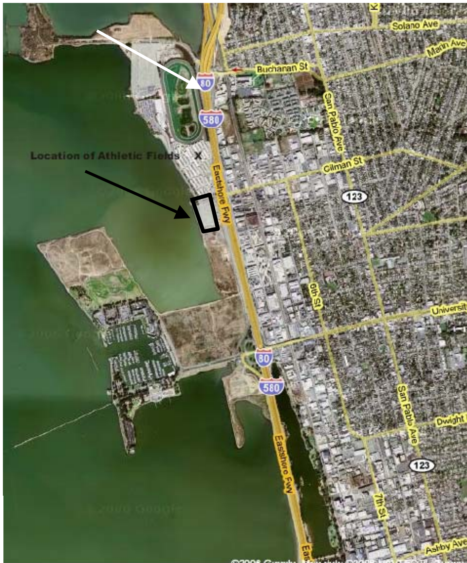
Gilman Fields Location