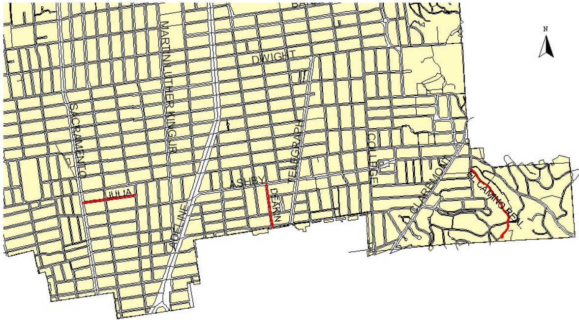
STREET REHABILITATION FY 2008 PHASE 1 LOCATION MAP