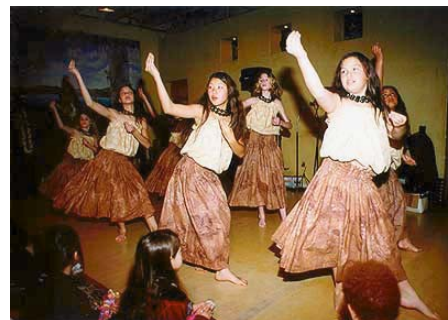
The KaUaTuahine Polynesian Dance Company.

With the success of the Downtown Arts District and the development of districts in South and West Berkeley, the arts have captured the attention of City