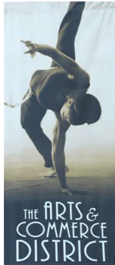
Arts District Banner, courtesy of the Downtown Berkeley Association.

The arts have proven to be an effective generator of economic growth and stability. Ranking as one of the largest economic sectors in Berkeley, the