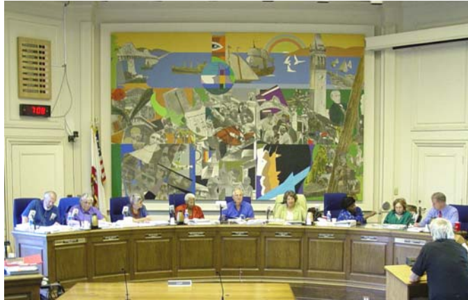
The Romare Bearden Mural as viewed in the City Council Chambers.