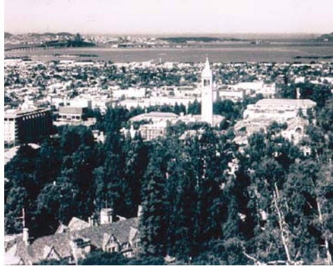
Panoramic view of Berkeley.

B ERKELEY is a culturally rich, vibrant community characterized by its diversity, its collective nature, and its remarkable history as a home for creative and intellectual movements. The city is famous for its distinguished university, beautiful natural setting, positive environment for innovative business, and highly educated population. It is a city where one can hear live music and poetry at the farmer's market and spend an afternoon browsing eclectic street-arts fairs; a place where one can attend world-class theater and award-winning performances; a community that regularly celebrates its diverse ethnic traditions at various cultural venues. It is a city known for its flair and endless variety of attractions.