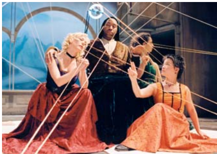
Berkeley Repertory Theatre's production of The Notebooks of Leonardo da Vinci .

The population of Berkeley is more diverse than typically found in a city of just over 100,000 residents. Its creative community comprises a large number of renowned artists and arts organizations that range from the solo artist to large-scale institutions. Within Berkeley's borders alone are seven museums, over 20 art galleries, a dozen major performance centers, an impressive number of independent publishers and some 50 theater, dance and music organizations.