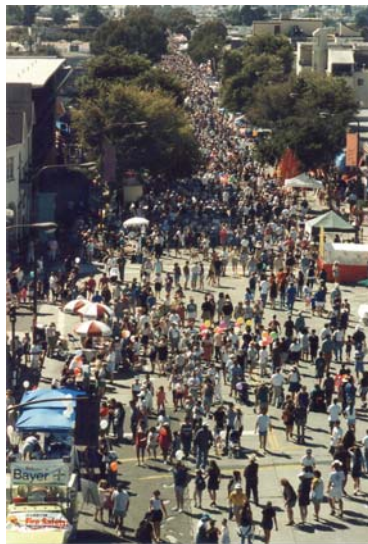
Berkeley's Annual Solano Stroll

The surveys, factual analysis, and information-gathering documentation that provide the background for the Arts and Culture Plan are included in the ArtsMarket report, The Berkeley Cultural Needs Assessment and Findings , which is posted on the City's Website at www.ci.berkeley.ca.us/civicarts/artscultureplan.htm . Hard copies of the full report can be obtained by request through the Civic Arts Program, in the Office of Economic Development.