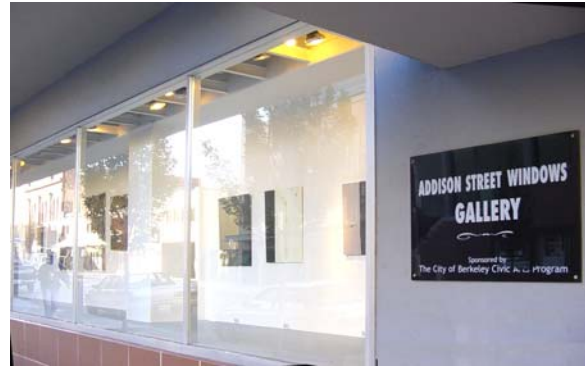
The Addison Street Windows Gallery.

funding, the grants enable these organizations to leverage additional