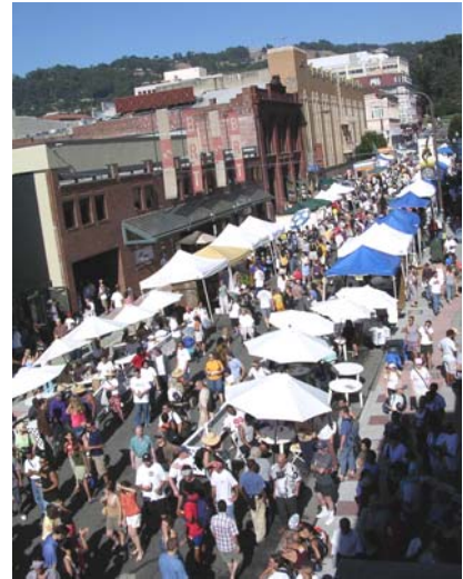
The Front Row Festival Celebrates the Opening of the Downtown Arts District

Utilizing the compiled data and analysis provided by ArtsMarket, the Civic Arts Commission, Civic Arts staff, members of the Berkeley Cultural Trust and the community, worked together to draft the actions and policies of the Arts and Culture Plan.