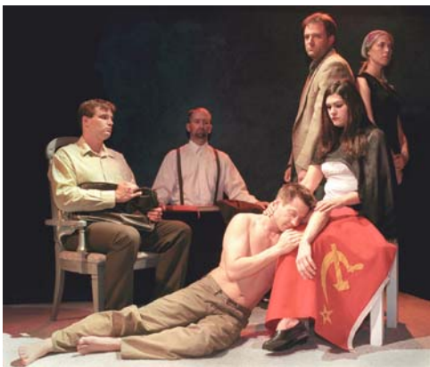
The Transparent Theater's presentation of Eternity is in Love with the Productions of Time .