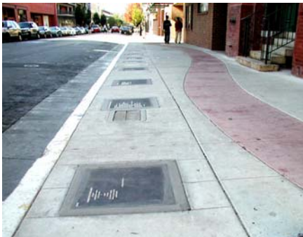
The Berkeley Poetry Walk on Addison Street.

The Civic Arts Program is a service-based program that supports the growth and vitality of the arts in Berkeley. The major areas of the program are Public Art, the Addison Street Windows Gallery and the Civic Center Gallery, Civic Arts Grants, Technical Assistance, Fund-raising and Marketing of the arts through press releases and as the site contact for press and media correspondents. Civic Arts staff also represent the Berkeley arts community in various local, state and national arts organizations, bringing news, advocacy and funding information back to the community. The staff attends local committees to integrate city programs with community arts activities. The Civic Arts program also