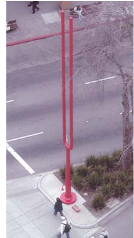
Earthsong for Berkeley , by artist Wang PoShu.

The cultural currency of the arts enriches each segment of our community. Just as monetary capital allows for building and maintaining a solid infrastructure to support and ensure a thriving community, the arts provide the foundation for a genuine sense of community. They offer a means of reaching a shared vision, reflect who we are as a community, and confirm what we value and can achieve together.