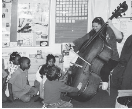
Students engaged in a music education program.