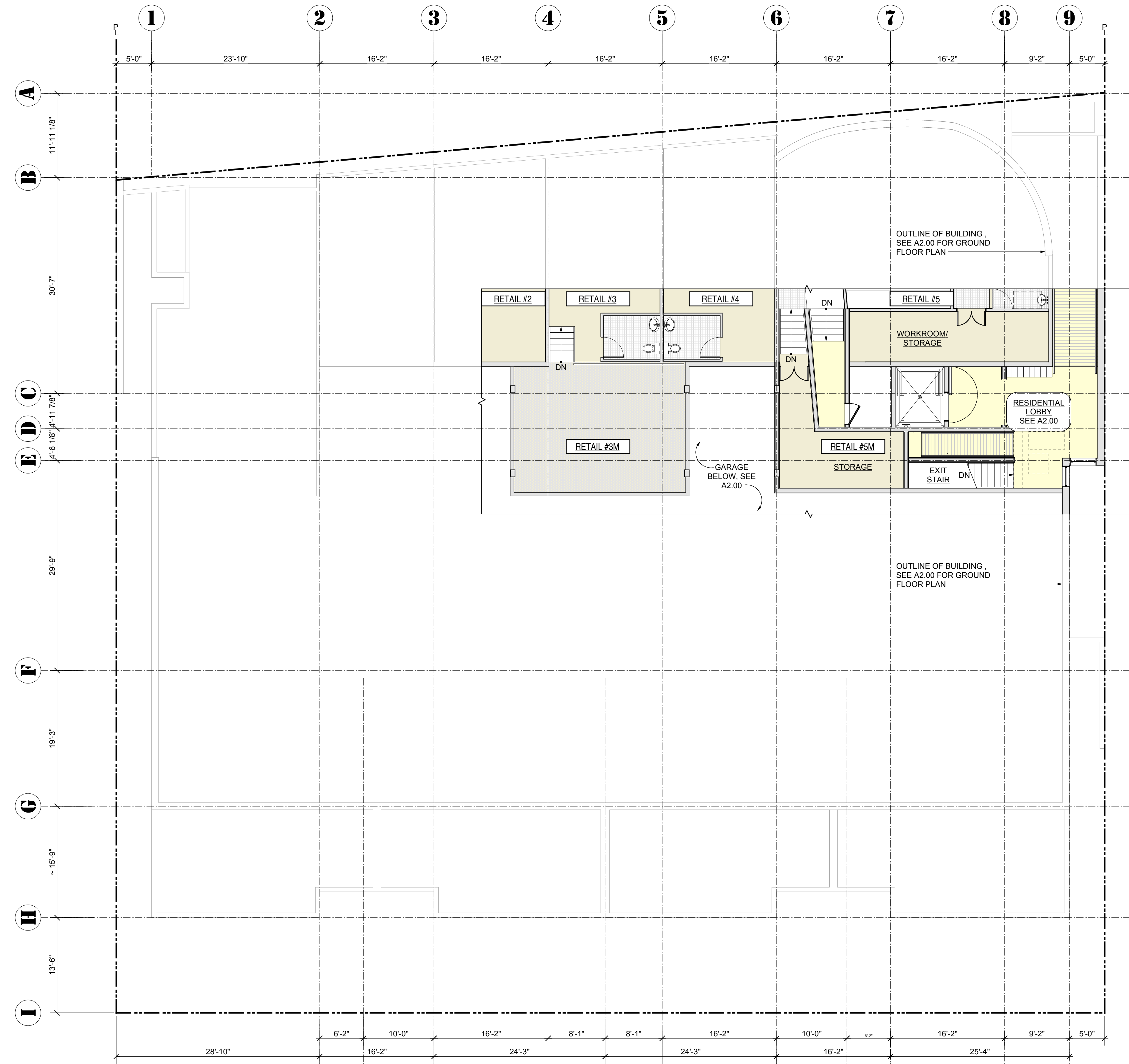
1 GROUND FLOOR MEZZANINE PLAN Scale: 1/8" = 1'-0"

© Thomas Dolan Architecture. Thomas Dolan Architecture reserves all common law, statutory and other intellectual property rights, including copyrights, in this document and the work of its architects, engineers, planners and other professionals. This document is the property of Thomas Dolan Architecture and is not to be reproduced, stored in a retrieval system, or transmitted in any form or by any means, electronic, mechanical, photocopying, recording, or by any information storage and retrieval system, without the prior written permission of Thomas Dolan Architecture.